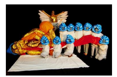
Birthday of the Dancing Buddho 2014, Video 6:16 minutes