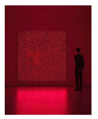
Miyajima Tatsuo Innumerable Life/Buddha CCIDD-01 2018 Collection: Mori Art Museum, Tokyo