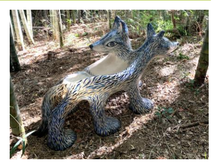
Wolf Bench 2022 W 1.9 x D 0.8 x H 1.1m FRP, water-based pain

Storytelling Table Runner ongoing since 2014 30 x 45 cm each fabric, embroidery thread, cotton, mixed media