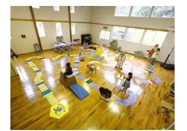
Tsumaari Sugoroku 2021