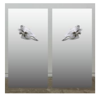
Mrs. Yuki a 2023 giraffe skull, aluminum mirror 240 x 260 cm