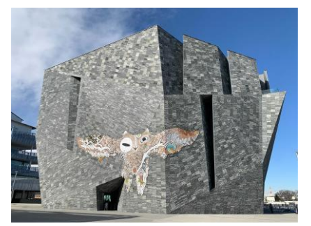
Musashino BLACK KITE 2021 Approx. W24 x H10m Water-based paint, Crayon on Cowskin Collection of Kadokawa Culture Promotion Foundation © 2021 Tomoko Konoike