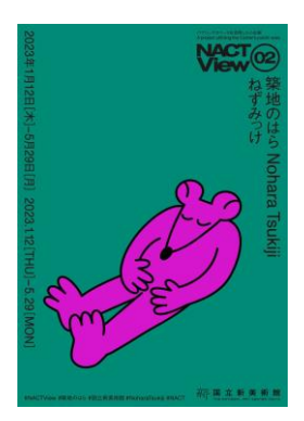
NACT View 02 Tsukiji Nohara Nezumikke Flyer Design © Nohara Tsukiji

Part of the early exhibition viewing program