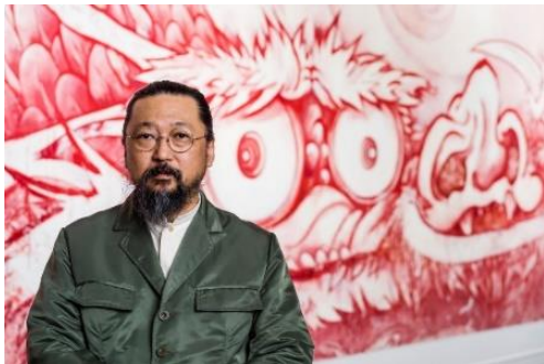
Photo by Museum of Fine Arts, Boston ©Takashi Murakami/Kaikai Kiki Co., Ltd. All Rights Reserved.

Seen from outside Japan, Tokyo is an extreme megalopolis. Like, a straight-out-of-Blade-Runner sort of metropolis. People may assume that beautiful robot girls walk around town.