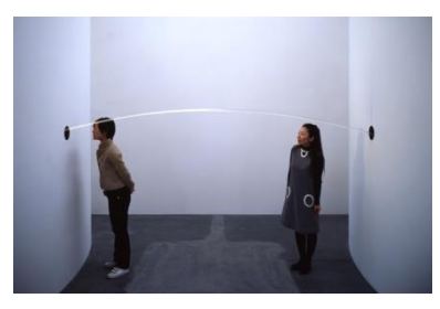
"Continuity Inbetween". 2006