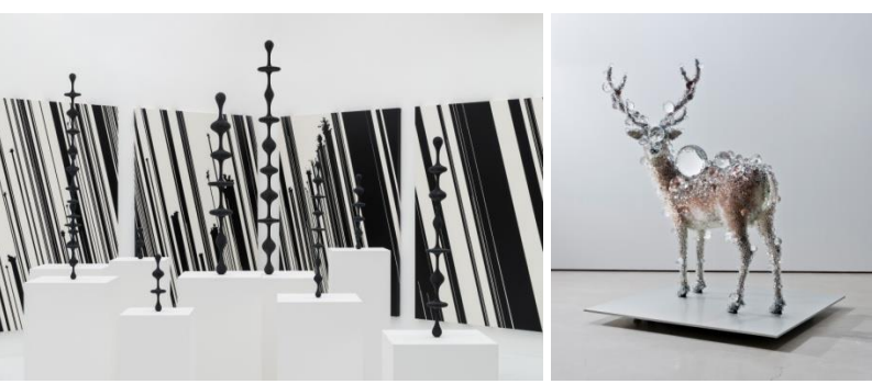
Installation view: mission [SPACE×ART] - beyond cosmologies, Museum of Contemporary Art Tokyo, Tokyo 2014