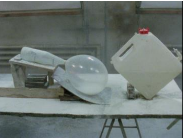
"The Way Things Go", 1987