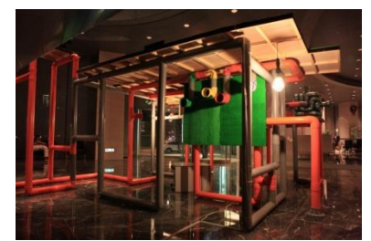
"As Hear/say", 2015

- Time and date: October 21 (Fri) - 23 (Sun) - Venue: Reine Roppongi Building B1F