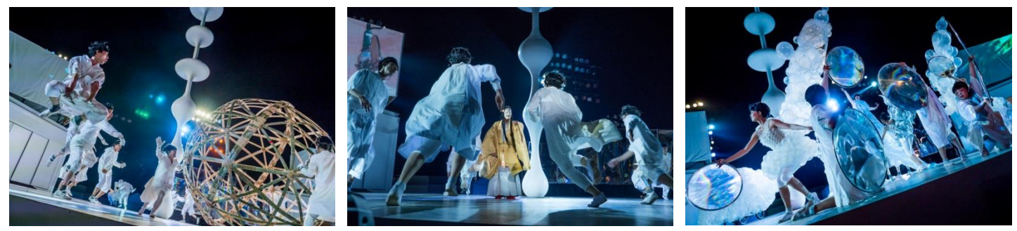
The public workshop being held at Komazawa Olympic Park in 2015