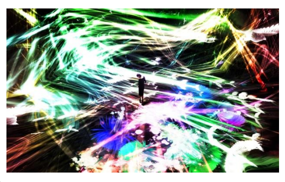
teamLab "Crows are Chased and the Chasing Crows are Destined to be Chased as well, Blossoming on Collision - Light in Space" 2016

Astronomy manuscripts penned by genius Leonardo da Vinci are on display in Japan for the first time ever. A new interactive installation by teamLab is also on display. Our universe is of perennial interest, appearing in art all around the world as an object of worship and study over the centuries, and spawning countless stories. "The Universe and Art," in just one exhibition, will offer a diverse selection of around 200 items from across the globe and down the centuries, in multiple genres, from meteorites and fossils to historic astronomical material by Da Vinci and Galileo; mandalas; Taketori Monogatari (The Tale of the Bamboo Cutter) which we may call Japan's oldest sci-fi novel; installations by contemporary artists, and the latest from the frontline of space development. Join us on a journey exploring where we came from, and where we are going, as Roppongi turns into a portal to the cosmos.