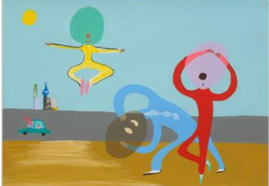
"Park Exercise", 2008 Courtesy: Kate Macgarry, London

"Labyrinth", 2013, Hiroshima Prefectural Art Museum