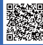
[List of Participating Shops] Special services