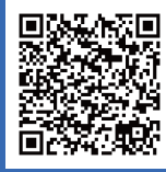
[List of Participating Shops] Extension of business hours