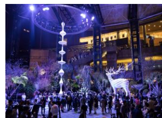
Kohei Nara/Seijun Nishihata/daisy Balloon Main Program

*The 2011 event was cancelled due to The Great East Japan Earthquake