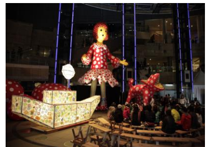
Yayoi Kusama 《Love Forever, The Future is Mine!》

2013 830 thousand people 2014 700 thousand people 2015 780 thousand people 2016 630 thousand people