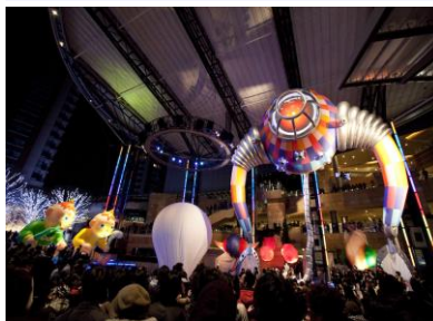
Noboru Tsubaki 《Before Flower》