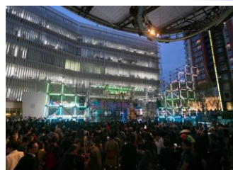
Seiichi Saito 《Art Truck Project "Hal" "Akebono"》