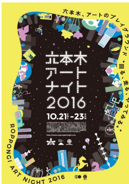
Main Visuals of Roppongi Art Night 2016

This art night has been put together to let people gather and participate in art to relive those playful times that have been forgotten in the bustle of everyday life. It may seem old-fashioned but wouldn't you like to spend time in Roppongi to get a renewed sense of reality by seeing, hearing, touching and experiencing art for yourself?