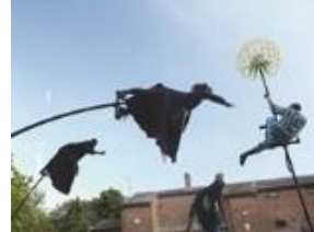
The Garden (Graeae Theatre Company)