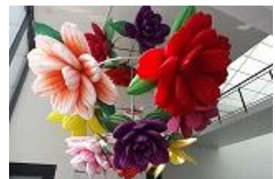
Flower Chandelier, 2012