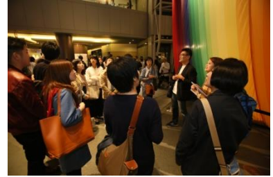
Last year's tour