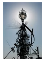
Takuo Yamada Homage to Eclipse