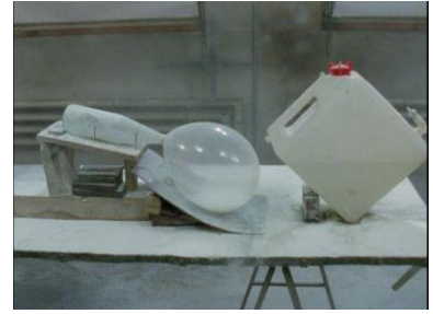
"The Way Things Go", 1987