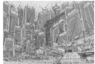
Daisuke Tajima, "Hyper View of Metallic Superpower", 2016, private collection