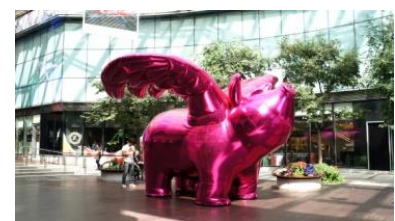
Love Me, 2013