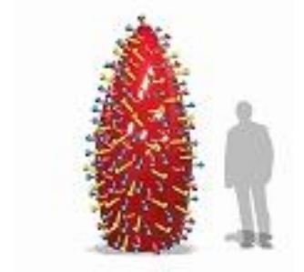
* Image is an artist's impression.