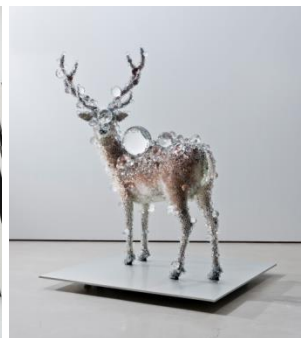
"PixCell-Deer#24" 2011 mixed media h:2020 w:1820 d:1500 mm collection: The Metropolitan Museum of Art, New York, USA courtesy: SCAI THE BATHHOUSE, Tokyo photo: Nobutada OMOTE | SANDWICH