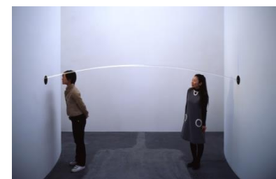
"Continuity Inbetween", 2006