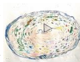
Tomoko Iwata Installing the solar system on the ground