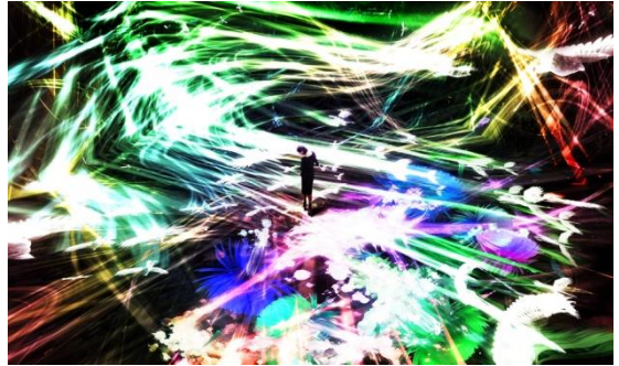
teamLab "Crows are Chased and the Chasing Crows are Destined to be Chased as well, Blossoming on Collision - Light in Space" 2016

Astronomy manuscripts penned by genius Leonardo da Vinci are on display in Japan for the first time ever. A new interactive installation by teamLab is also on display. Our universe is of perennial interest, appearing in art all around the world as an object of worship and study over the centuries, and spawning countless stories. "The Universe and Art," in just one exhibition, will offer a diverse selection of around 200 items from across the globe and down the centuries, in multiple genres, from meteorites and fossils to historic astronomical material by Da Vinci and Galileo; mandalas; Taketori Monogatari (The Tale of the Bamboo Cutter) which we may call Japan's oldest sci-fi novel; installations by contemporary artists, and the latest from the frontline of space development. Join us on a journey exploring where we came from, and where we are going, as Roppongi turns into a portal to the cosmos.