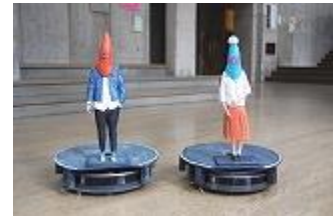
Kenichi Obana, "Close yet far"