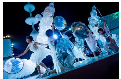
The public workshop being held at Komazawa Olympic Park in 2015