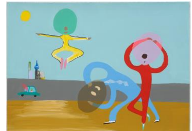
"Park Exercise", 2008