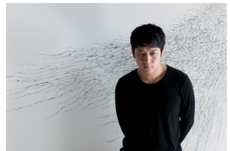
Main Program Artist: Kohei Nawa

Sculptor born in Osaka in 1975. Graduated from Kyoto City University of Arts Faculty of Fine Art majoring in sculpture in 1998. Completed the Masters Course in sculpture at the Kyoto City University of Arts Graduate School of Arts in 2000. Completed the Doctoral Course in sculpture at the Kyoto City University of Arts Graduate School of Arts in 2003. Launched the "SANDWICH" platform for production in Fushimi-ku, Kyoto. Held the KOHEI NAWA SYNTHESIS exhibition at the Museum of Contemporary Art Tokyo in 2011 and the FORCE exhibition at SCAI THE BATHHOUSE and PACE LONDON in 2015. Focusing on the unique concept of "PixCell" combining Pixel and Cell, he is expanding the potential of sculpture by utilizing a variety of technologies and materials such as beads, prisms, polyurethane foam and silicone oil. He is a professor at the Kyoto University of Art and Design Graduate School of Art and Design Studies.