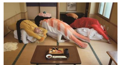
Sushi performance “Sushi” @ Azumazushi