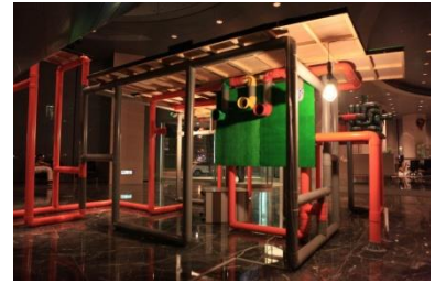
"As Hear/say", 2015