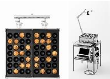
"Takoyaki Sequencer", 2014