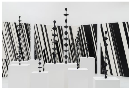
Installation view: mission [SPACE×ART] - beyond cosmologies, Museum of Contemporary Art Tokyo, Tokyo 2014