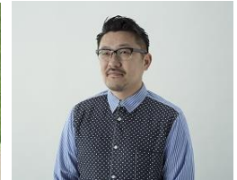
Rhizomatiks Architecture Seiichi Saito