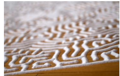
"Labyrinth", 2013, Hiroshima Prefectural Art Museum