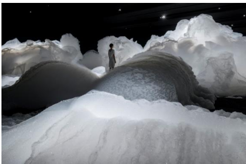
"Foam" 2013 mixed media dimensions variable installation view, AICHI TRIENNALE 2013, Aichi