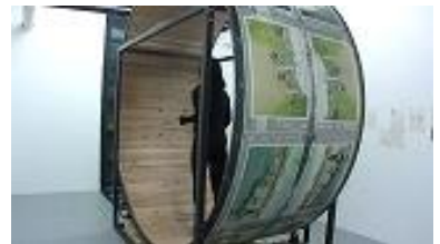
"Beneath the Wheel", 2011